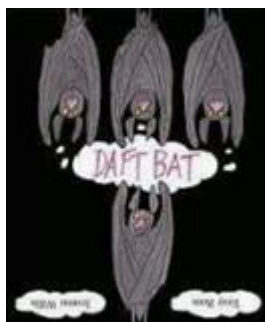
Daft Bat by Jeanne Willis. (Can be found on youtube)